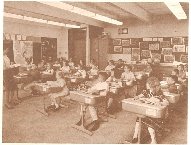
A second level classroom — Miss Goldstein's fourth grade.